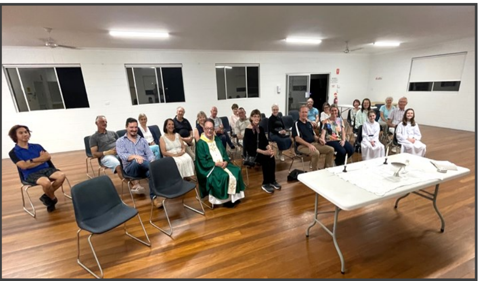
The recent gathering at Banksia Hall, Hope Island to discuss the future pastoral care of Hope Island.

Many humans are on a lifelong quest for wisdom, and that quest calls for a high level of vigilance or spiritual readiness. As Christians, we believe God personifies true wisdom. In seeking wisdom, therefore, we are seeking God. Through the biblical Book of Wisdom, we come to understand that God's wisdom possesses a radiance, which makes it easy to find. In embracing this wisdom, one gains an inner radiance. When we first read this story, we may have been struck by the bridesmaids' unwillingness to share their oil. This precious oil, however, represents that which keeps faith alive for the believer. One person cannot give this to another. Each individual must cultivate faith within his or her own heart. Matthew knows this task to be difficult at times. The cares of everyday life can create tremendous pressures and burdens. But in seeking God's wisdom, we will be gifted with the interior strength of grace, which will let our light of faith shine. Matthew also reminds us that Christ comes amid history, in the ordinariness of our daily lives, and for this reason we must undertake the spiritual work to stand ready.