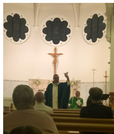
Last Mass in Jubilee Parish

Some photos from my early days in the parish.