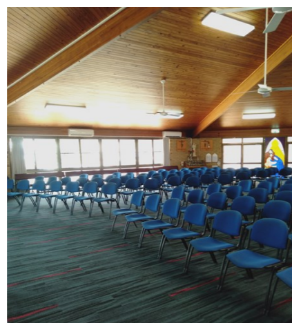
Remember when chairs didn't have to social distance.