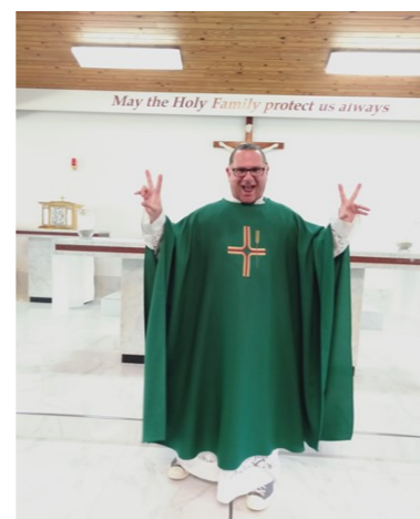
First newsletter post. God bless you all, as we journey together.